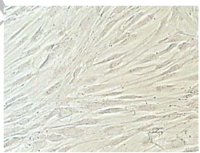
Figure 1. Mesenchymal stem cells in culture.

Immunophenotyping. At the end of the last passage, surface expression of CD166, CD105, CD44, CD13 (MSC markers), CD34, CD45 (HSC markers) and CD31 (endothelial cell marker) were determined in culture-expanded MSCs. Anti CD44, CD45, and CD34 fluorescein isothiocyanate (FITC), anti-CD13 and CD31 phycoerythrin (PE) all from Dako (Denmark), anti CD166 FITC and anti CD105 PE were purchased from Serotec (Italy). Relevant isotope control antibodies were also used. Flow cytometry was performed on a FACScan (Becton Dickinson) and data were analysed with Cellquest software. Typical flow cytometry profile and Immunohistochemistry staining of MSCs isolated from this study are shown in figures 1-3.